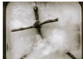
Free Stick Man! icy Sensory Play

Adults Role- Model and support children to, in meaningful contexts find: longer/ shorter, heavier/ lighter, more/ less full of two items.